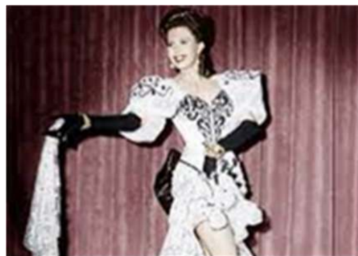
Lula - Partly Frocked