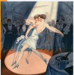
Jungle Swing (u Tube Music Link) JUNGLE SWING GOT EVERYONE ON THEIR FEET. THERE WAS NOT AN EMPTY TABLE TO BE SEEN. A TUNE FROM THE 20S FOR A CROWD FROM THE 2020S.