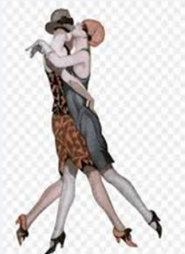
Let's call the whole thing off (u tube music link) IS THE LAST THING THESE TWO GORGEOUS THINGS FROM TAT HAD ON THEIR MIND. A BEAUTIFULLY JOYOUS VERSION OF THIS CLASSIC WAS A