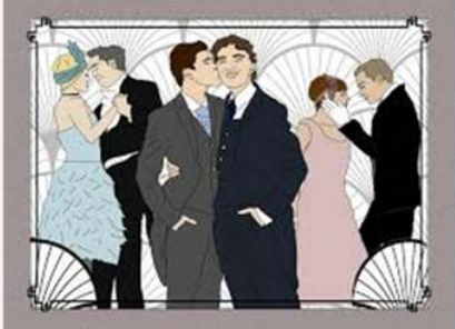
MIDDIES, SOCIALLY AWKWARD AT FIRST, DISCUSS THEIR NEXT MOVE. WHERE DID THEY LEAVE THEIR PHONES? LET'S MISBEHAVE SEEMED LIKE THE PERFECT SONG TO TAKE THOSE FIRST TENTATIVE STEPS TO NON-ELECTRONIC INTERACTION