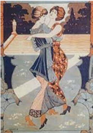
STYLE PLUS FROM THESE LEURA LADIES FROM THE GETREAL TABLE