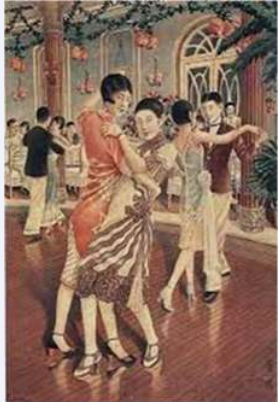
MMLTs WERE QUICK OFF THE MARK. HATS WERE OPTIONAL BUT THE MACRAME WOVE ITS MAGIC IN SUBTLE WAYS.