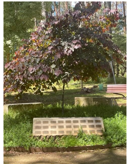
AIDS Memorial, Medlow Bath Park

Follow us on Facebook , Instagram and BlueSky or hashtag #BlueMountainsPride . Email us at bluemountainspride@gmail.com .